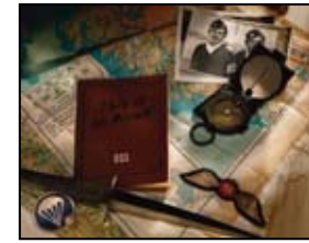
Office of Strategic Services featured on page 7

Like all Allied forces that operated behind Nazi lines, the Jedburghs were subject to torture and execution in the event of capture under Hitler's notorious Commando Order. A few weeks before the Normandy invasion, the German High Command had broadcast the following warning: "Whoever on French territory outside of the zone of legal combat is captured and identified as having participated in sabotage, terrorism, or revolt remains