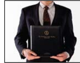
The President's Briefer featured on page 19

The binder the President's briefer holds in this photograph contained the first President's Daily Brief (PDB) presented to President George W. Bush in 2001. The PDB is an exclusive publication for the President, Vice-President, and senior advisers. It includes analysis and intelligence reports critical to national security.