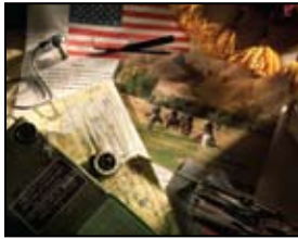
Team Alpha featured on page 23

This portrait of a CIA nurse was taken a few months before her retirement. Her final international trip for CIA was to Kabul, where she was a member of a medical clinic serving officers and locally hired people. This was her fourth trip for CIA since 9/11 to staff medical clinics in the war zones of Afghanistan and Iraq.