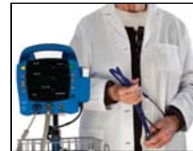
Nurse featured on page 21

In the course of CIA's first six decades, medical officers have received numerous commendations for bravery and devotion to duty. Since 9/11 these commendations have included three Intelligence Stars awarded to medical officers and the Distinguished Intelligence Cross conferred on a physician assistant for his valorous actions during the attempted rescue of a mortally wounded paramilitary officer overwhelmed by hostile forces.