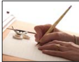
Calligrapher featured on page 35

mark the loss of officers whose identities must remain covert. This secrecy, even in death, represents a final act of fidelity to the people who trusted them, to the national security programs they participated in, and to the craft and disciplines of intelligence work. The full roll call of all CIA's fallen officers is read aloud once a year at CIA's annual memorial ceremony.