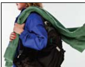
Logistics in Action featured on page 27

Special Activities Division (SAD) is home to the National Clandestine Service's covert action infrastructure. SAD officers serve globally and are called upon to respond to critical operational needs with speed, skill, and the utmost secrecy. They routinely demonstrate ingenuity, courage, and perseverance under adverse and isolated conditions. They serve and sacrifice in silence. As of the date of this publication, 57 officers from SAD and its predecessor organizations have been killed in action in the course of CIA's history.