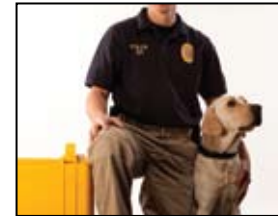
Partners featured on page 29

The K-9 teams form very strong cross-species partnerships. After dog and handler are paired, they complete the Bureau of Alcohol, Tobacco and Firearms’ rigorous 10-week training program during which human and dog learn to rely on each other and to work as a cohesive unit to locate and identify a wide variety of harmful materials. These highly