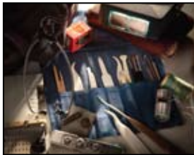
Tradecraft Tools featured on page 9