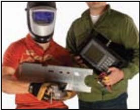
Tech Ops featured on page 31