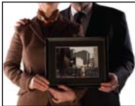
Husband and Wife featured on page 17