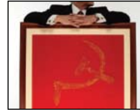
Case Officer featured on page 33

In this portrait, a much-decorated case officer stands over a flag captured from a particularly ruthless Peruvian terrorist group in a 2008 raid in Peru’s Huallaga Valley. The officer has had a varied and distinguished career serving in multiple dangerous locations in the Western Hemisphere and is currently deputy chief of the Latin America Division of NCS. He also has had overseas tours in war zones such as Iraq, exemplifying both the deep regional expertise and the readiness to serve globally that characterizes NCS officers.