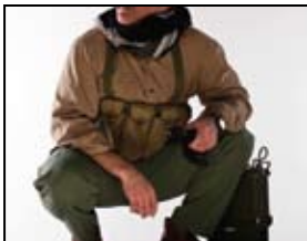
Warrior featured on page 25