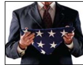
Flag featured on page 13