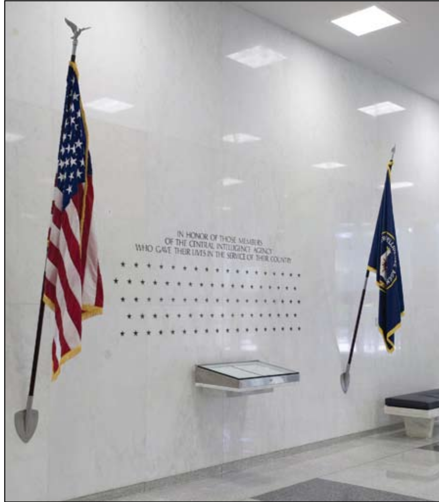
CIA Memorial Wall Original Headquarters Building